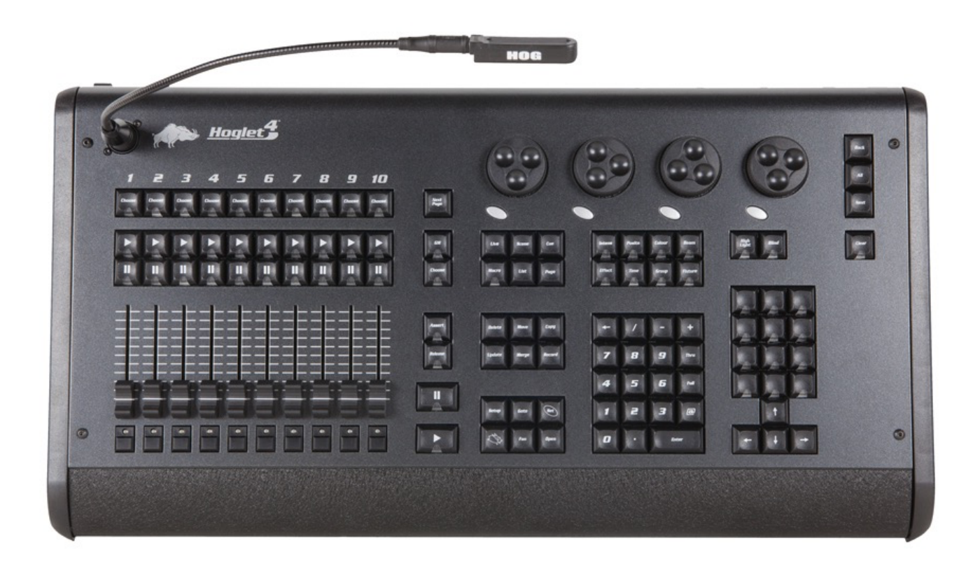
Hog 4 User Manual